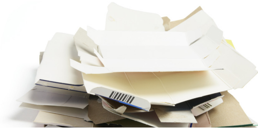
Clean flattened cardboard & paperboard