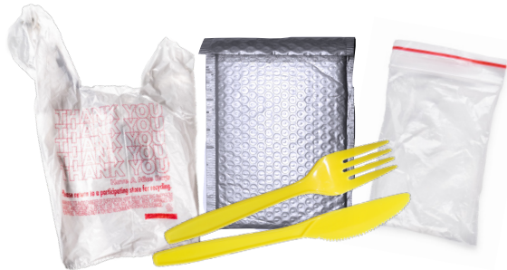
Plastic bags, utensils, film plastics