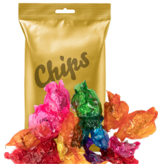
Chip bags & candy wrappers