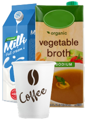
Coated paper & cartons