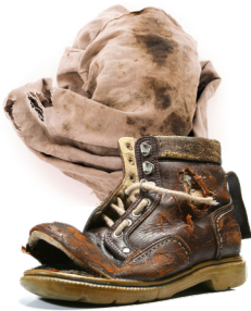
Clothing, shoes, blankets